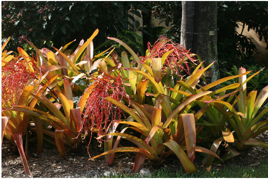
Aechmea blanchetiana - Fairchild Garden: