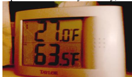
This thermometer says it all – too cold for unprotected plants!

Hopefully, you also have a number of bromeliads that survived the Winter just fine. Now is a good time to change out the mix in these pots. Replace it with some fresh media and add some of that same slow-release fertilizer that you gave to your freshly repotted offsets. By the way, we're just