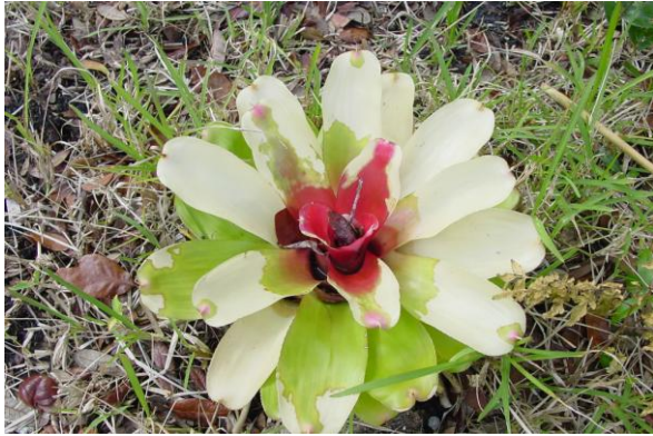
Neo. caroliniae with freeze-damaged leaves

about to enter our 'dry season' so pay close attention to your plants' watering needs during this period.