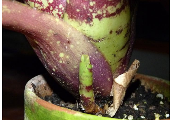
Offset forming at base of Neo. 'Gespacho'

axil that resembles a bit of dirt lodged in the base of the leaf. We all know how to split and strip leaves away on bromeliads, but now be especially careful in doing this – it's very easy to damage that tiny offset in the process and in fact, it is probably safer to use scissors or sharp shears to trim away portions of the dead leaves.