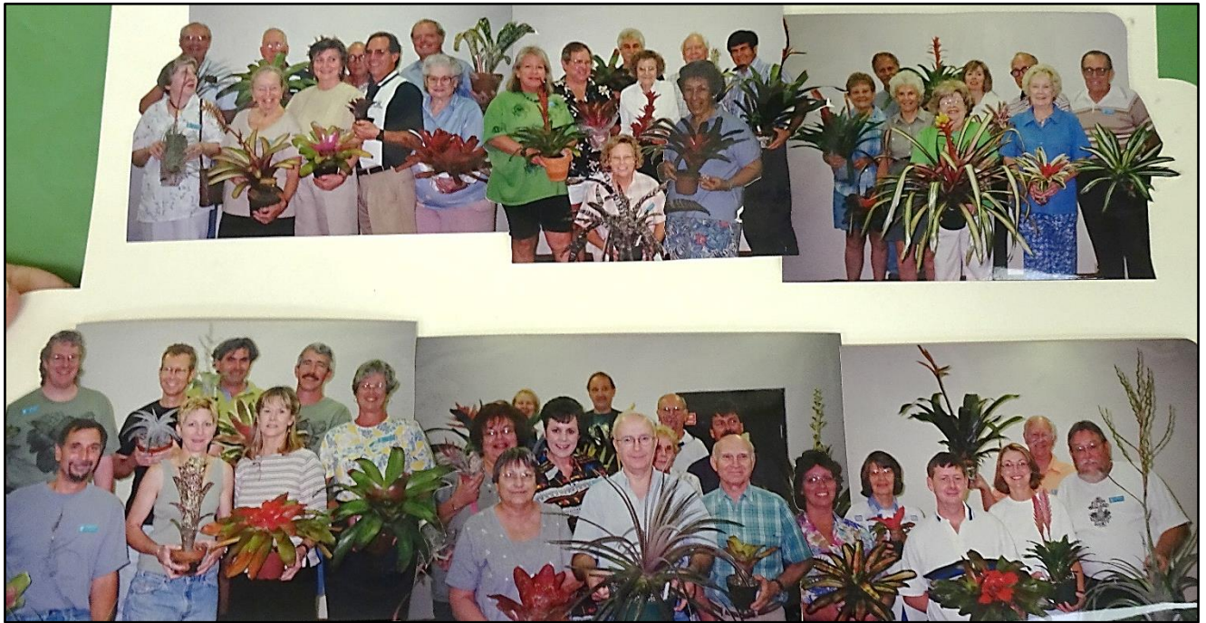
Collage of some FWCBS members, March, April 2000