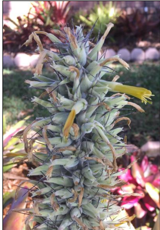
Six weeks later, terminal flowers open