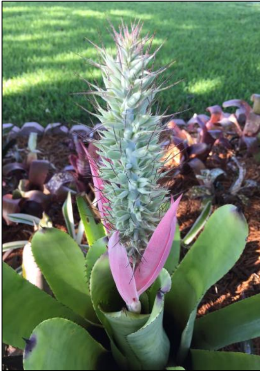
Full inflorescence; no flowers yet