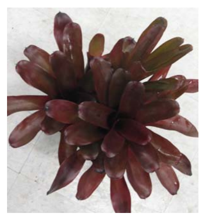
Neo. 'Purple Star' x 'Fireball'