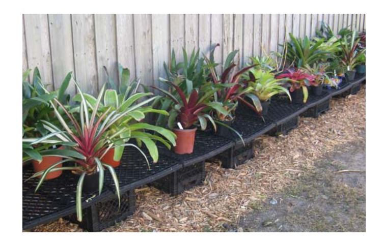
Clever space solutions seen in Lisa Robinette's garden, one of the Extravaganza tours.