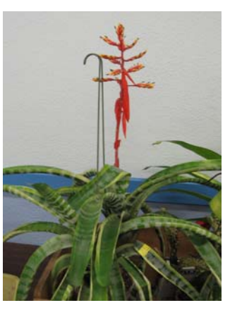
Aec. chantinii 'Shogun'