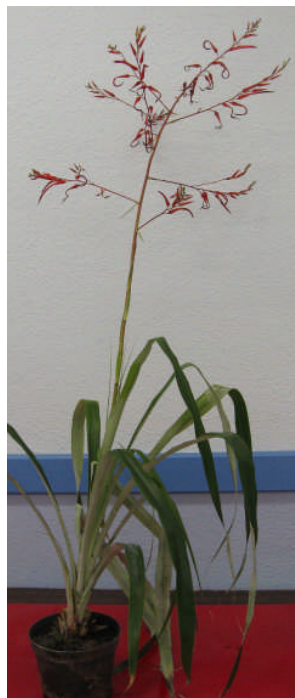
Pitcairnia unknown species (plant and closeup of stalk)