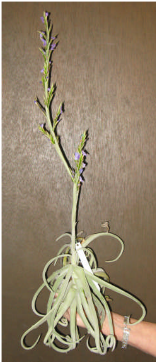
Til. duratii (large form)