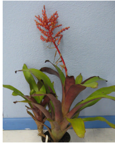
Aechmea chantinii x A. fulgens var. discolor