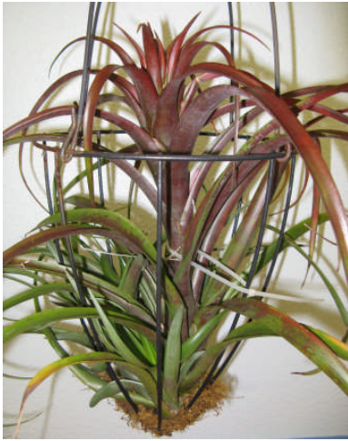
Til. capitata 'Red"

Below are pictures of Show and Tell plants.