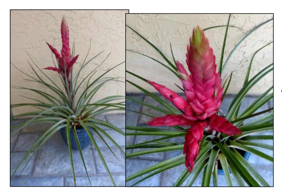
Tillandsia fasciculata 'Tropiflora'