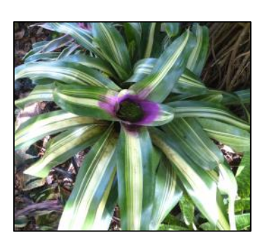
Neoregelia 'Lou Wilson'