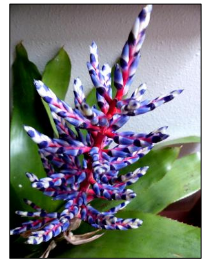
Aechmea 'Del Mar'