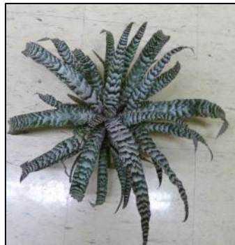
Crypt. 'Maggie Lee'