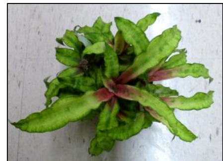
Cryptanthus 'Red Eye Gravy'