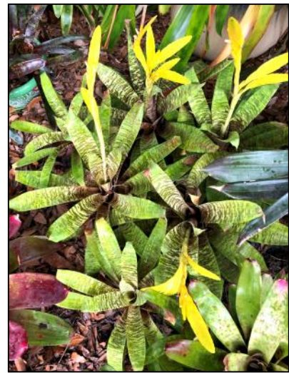
Goudaea ospinae var gruberi 'Smudge Grub'

On the right is a picture of a cluster of one of the several cultivars of Goudaea (formerly Vriesea ) ospinae v. gruberi . They are similar to each other for the most part and have names that include 'Smudge Grub', 'Ocean Mist', 'White Form', and 'Hawaiian Magic'.