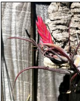
Tillandsia 'Purple Passion'