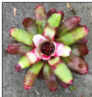
Neoregelia 'Strawberry Jamboree'