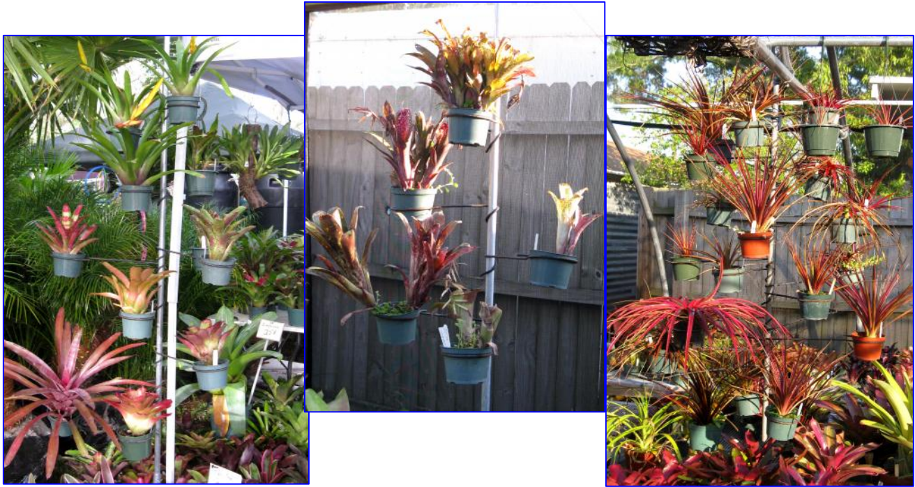
Examples of bromeliad trees made with plant rings for branches