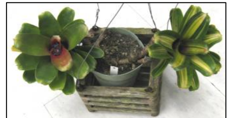
Neoregelia "Red Eye"