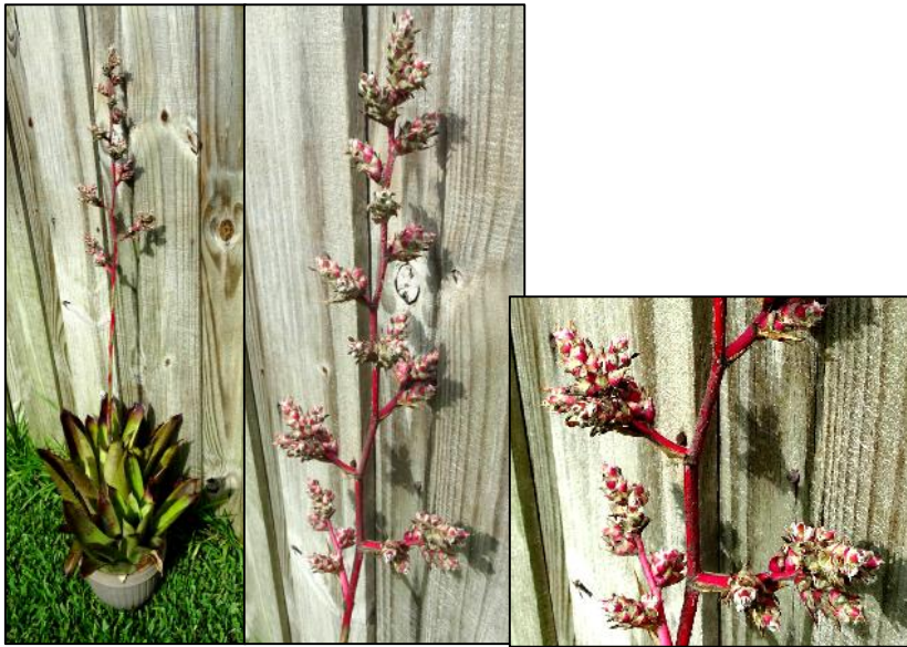
Hohenbergia 'Purple Majesty'