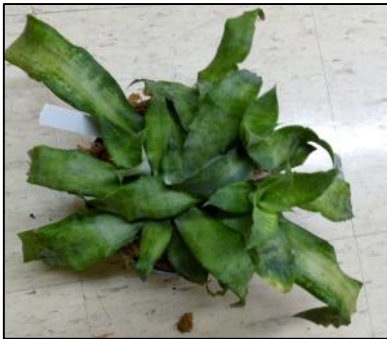
Crypt. 'Key Lime'

Below are pictures of some of the varieties of Cryptanthus .