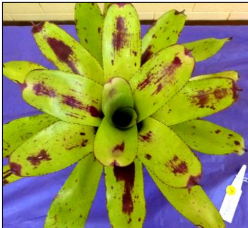
Neoregelia 'Painted Delight'