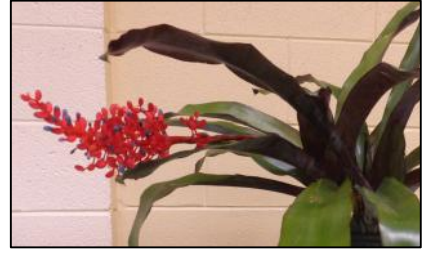
Aechmea fulgens discolor

Aechmea hybrid unknown Aechmea fulgens discolor (photo on right).