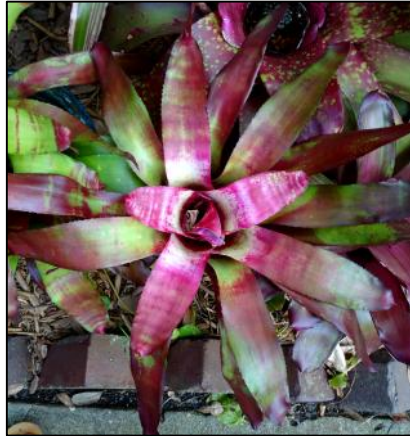
Neoregelia 'Raspberry Ripple'