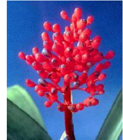
Aechmea miniata discolor