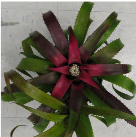
Neo. 'Brown Recluse'

Below are pictures of Show and Tell plants.