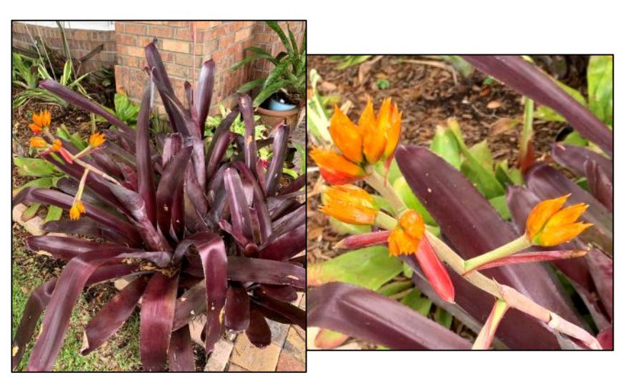
Aechmea mulfordii cv 'Malva' Can be grown in the landscape in bright sun

Gary Lund submitted the pictures below of bromeliads from his collection.