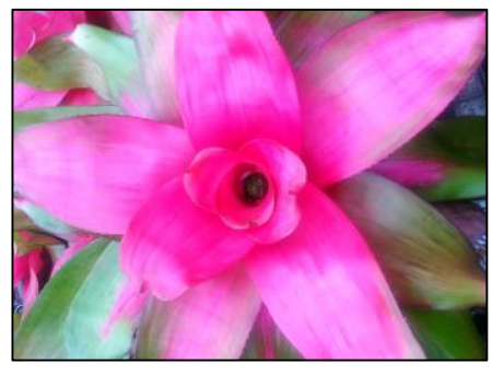
Neoregelia 'Pink Sensation' x 'Cordovan'