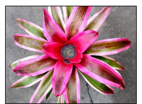
Neoregelia 'Cereza' albomarginated