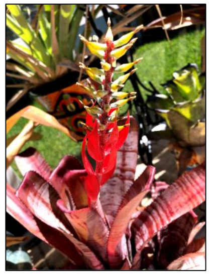
Aechmea nudicaulis 'Frosty the Snowman'