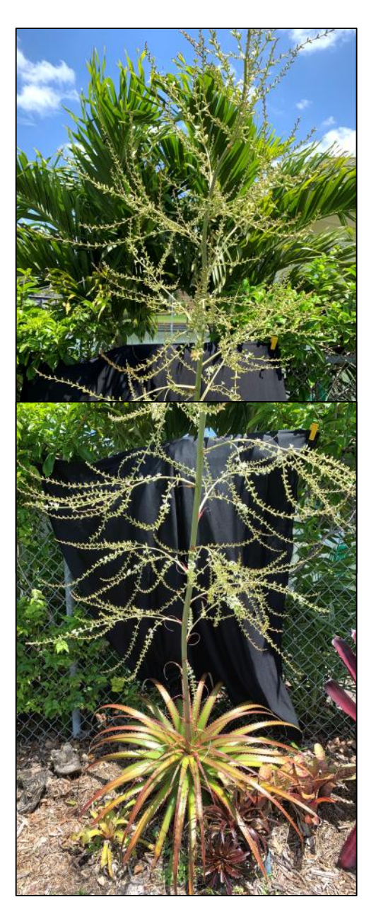
Two Hechtia guatemalensis