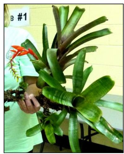
Aechmea nudicaulis 'Silver Streak'

And below are pictures of items in the silent auction.