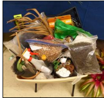
Tub o' Tools