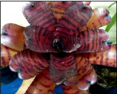
Neoregelia 'Groves Red Tiger'