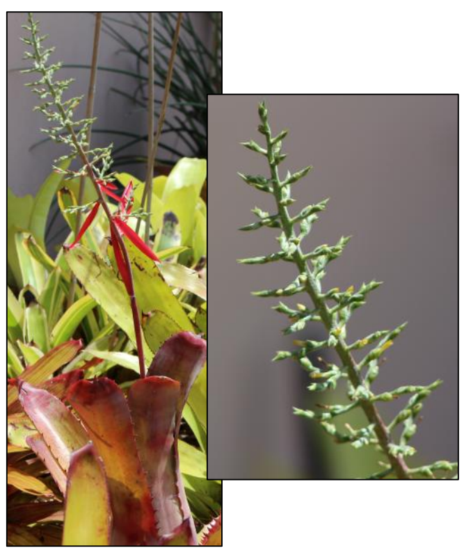
Aechmea bracteata rubra