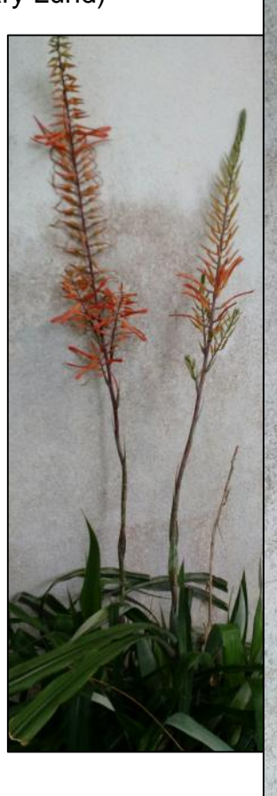
Pitcairnia, unknown species