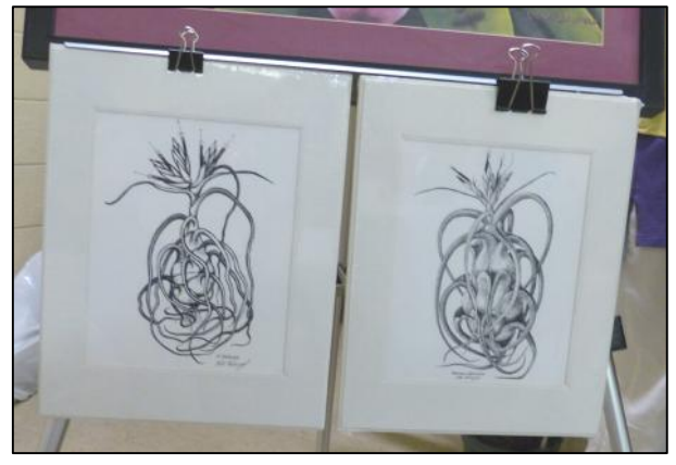
Art by Kiti Wenzel