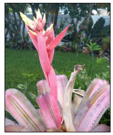
Aechmea Loie's Pride