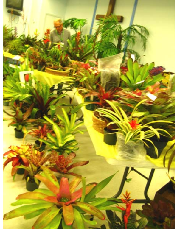
Potential bidders examined auction plants. ↑ ↑ →→