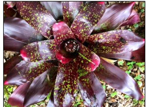
Neoregelia 'Jack of Diamonds'