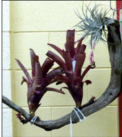
Aechmea nudicaulis and Tillandsia 'White Star'