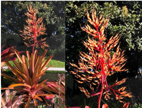
Portea 'Tambora', possibly Aechmea leptantha crossed with a Portea