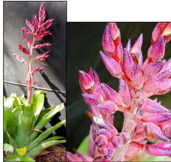
Aechmea 'Romero' ( Aec. fendleri x Aec. 'Permumazon')