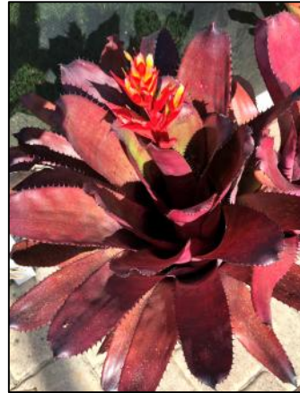
Aechmea chantinii hybrid by Bullis Nursery