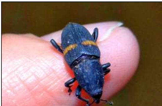
Adult weevil, Metamasius callizona

Florida has 16 native species of bromeliads, and 12 of those species, plus 2 natural hybrids, are threatened by the invasive Mexican bromeliad weevil Metamasius callizona (picture below, on the left). They are also threatened by illegal collecting and habitat destruction. The weevil was accidentally brought to Florida from Mexico in 1989, reportedly in a shipment of bromeliads to a Broward County nursery and has since become established in the southern and central portions of the state. Below on the right is a map that shows locations in Florida where the presence of the weevil has been documented.