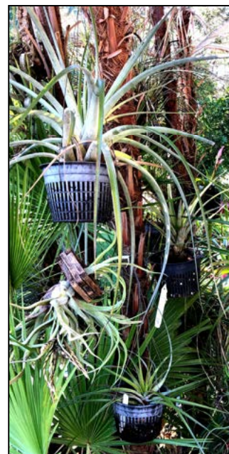
Tillandsia plants hanging from trunks of paurotis palms

The plants are hung two different ways--from the base of a frond stem (picture below on the left) and from a zip tie fastened around the trunk (picture below on the right). Using the base of a stem is fine for lighter weight plants while heavier plants tend to pull the stem down.