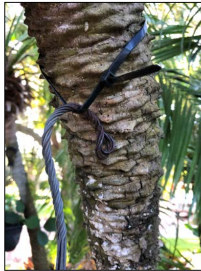
Hooks hanging from stem base (left) and zip tie (right)