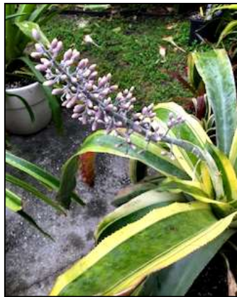
Aechmea mexicana , variegated