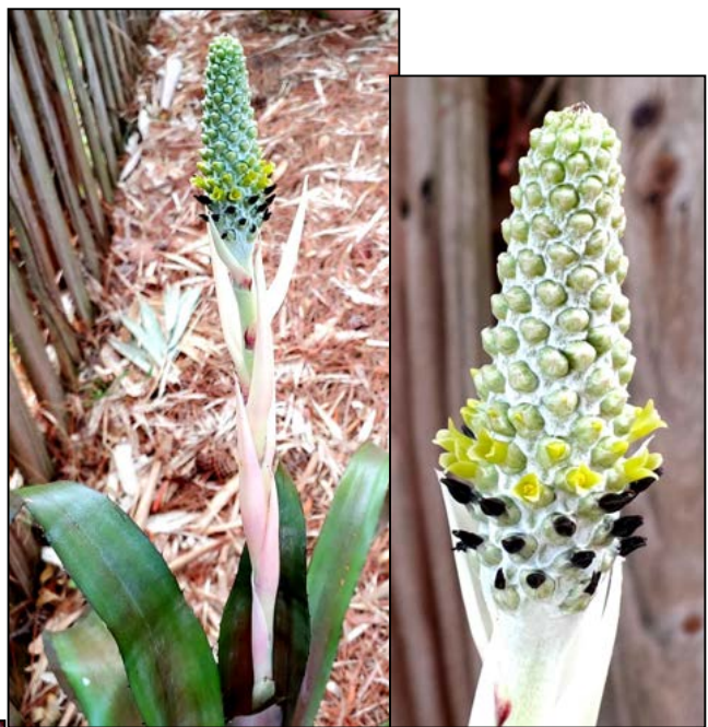
Aechmea bromeliifolia , submitted by Barb Gardner