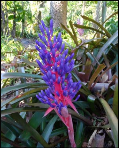
Portea species or hybrid, submitted by Richard Poole