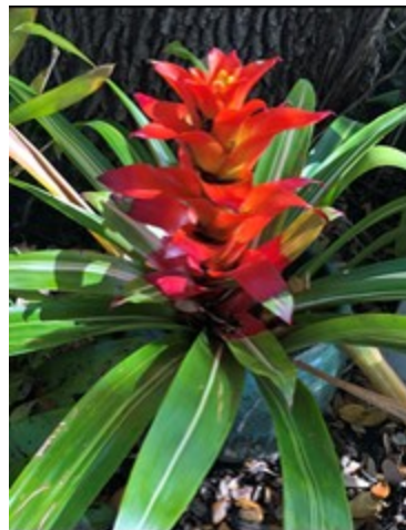
Guzmania 'Tutti Frutti', variegated