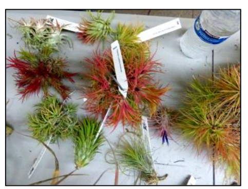
Tillandsia ionantha clones