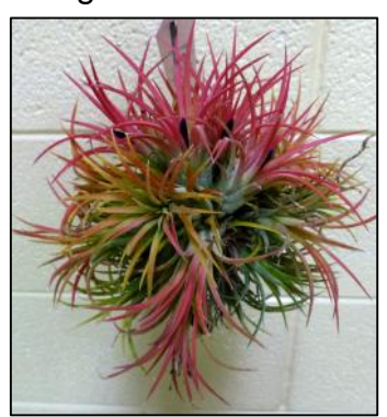
Tillandsia ionantha Honduras

Below are examples of different forms of Tillandsia capitata .