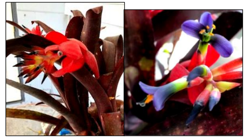
Billbergia hybrid, Bill Simms, No. 14/08; flower close-up