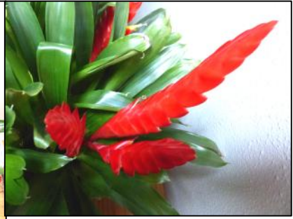
Close-up of Vriesea hybrid showing three stalks from one plant