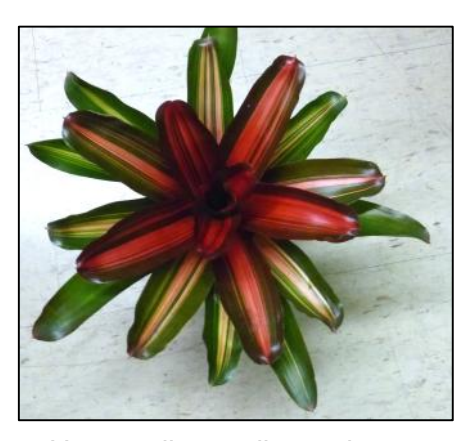
Neoregelia carolina variegata