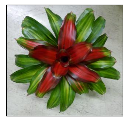
Neoregelia Debbie' variegata