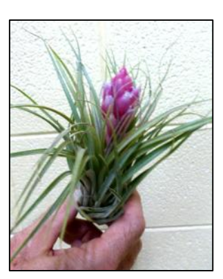
Tillandsia 'Cotton Candy'