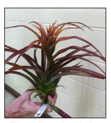
Tillandsia capitata Rubra