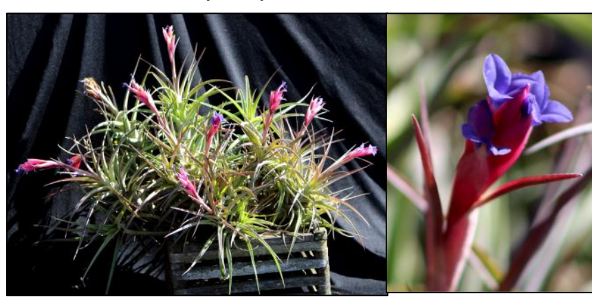
Tillandsia hybrid with close-up of flower