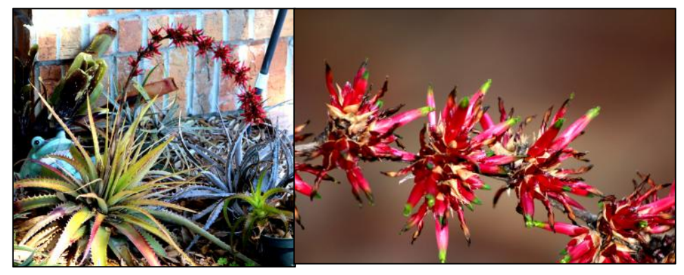
Deuterocohnia brevispicata, 2019

Gary has now submitted pictures of this same plant, shown below, that has, indeed, produced more flowers on the old stalk.