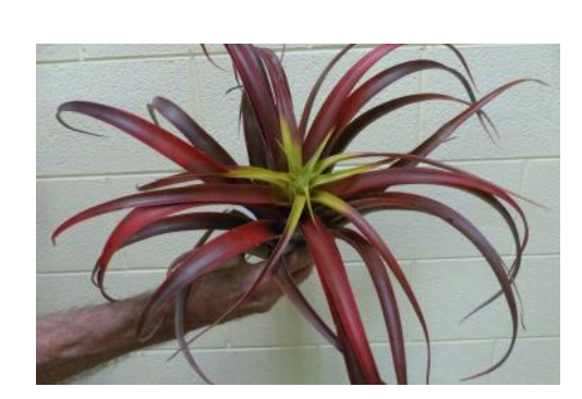
Tillandsia capitata Morron

Below are examples of different forms of Tillandsia capitata .