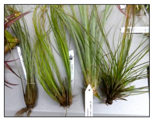
Tillandsia juncea clones

Other examples of the variability of Tillandsias include Tillandsia juncea pictured below on the left and the group of Tillandsia ionantha shown in the two photos on the right.