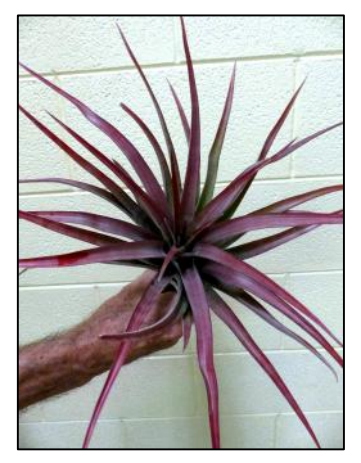
Tillandsia capitata Orange