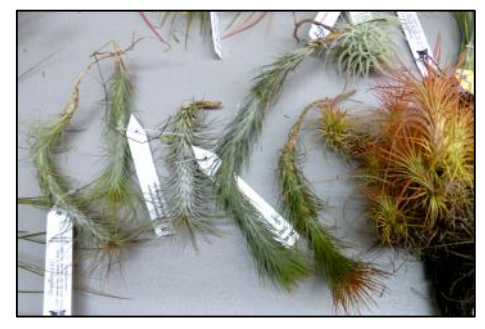
Tillandsia funckiana clones

be saxicolous (growing on rocks, with roots in the rocks) and grow in full sun. They can cover hillsides and cliffs that appear to be carpeted in red and orange when these plants are in bloom. One of these is Tillandsia funckiana , of which several clones are shown on the right, along with a cluster of a clone from Herb Hill, far right.