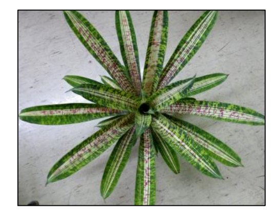
Goudaea ospinae variegated