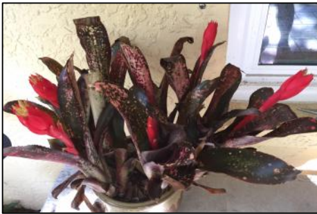
Billbergia 'Poquito Mas'