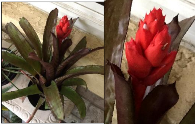
X Quesmea Que. edmundoi x Aec. orlandiana