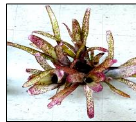
Billbergia 'Crimson Candle' x 'Borracho'- multiples of the same hybrid