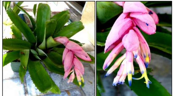
Billbergia sanderiana (slightly withered from the recent cold spell)