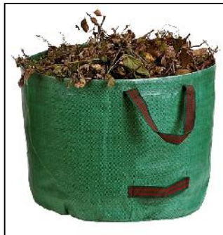
1. Garden tote bag