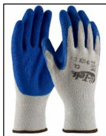
2. Rubberized gloves