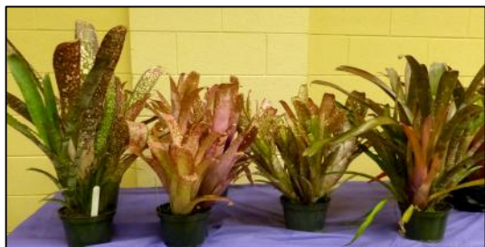
Billbergia 'Tarantella' x 'Muchacho'- four different hybrids

Dave shared with us more of the hybrids he has made. One of his breeding aims is to produce Billbergias with longer lasting bloom stalks. He had examples of three of his Billbergia crosses and the varying results he can get from the same cross. Below are pictures that show four different hybrids from the cross of Billbergia 'Muchacho' x 'Survivor', three different hybrids from the cross of Billbergia 'Tarantella' x 'Muchacho', and multiple plants of the same hybrid from the cross of Billbergia 'Crimson Candle' x 'Borracho'.