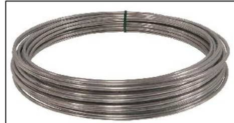
3. Roll of 9-gauge galvanized wire