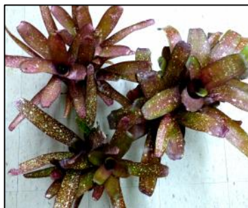
Billbergia 'Muchacho' x 'Survivor'-three different hybrids