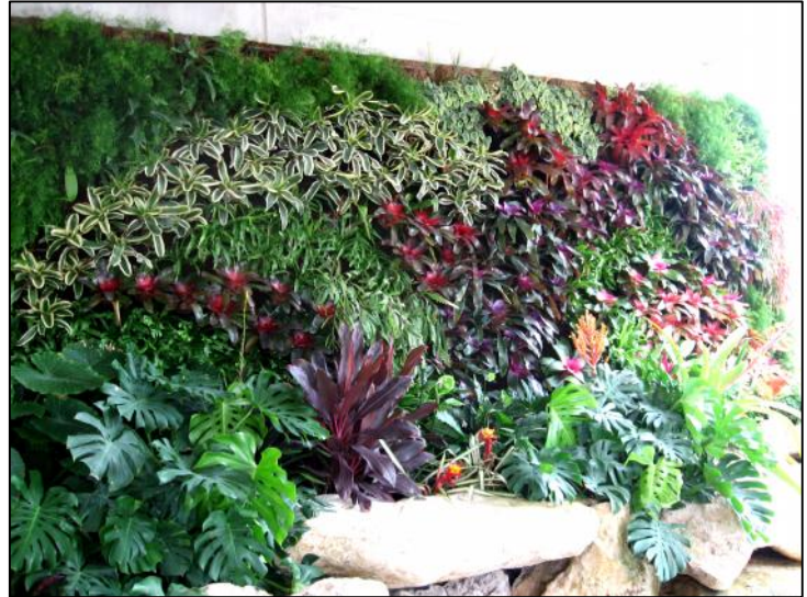
2016 Bromeliad Christmas Tree, Salvador Dalí Museum

As part of Nicole's job description at the Dalí she also maintains the living bromeliad wall (photo below on the right) that is outside the building, next to the museum entrance.