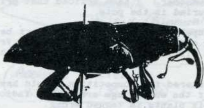
Metamasius callizona , lateral view