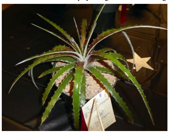
Excessive and poorly trimmed leaves.

Lanky leaves, gaps, two stages of growth, sloppy top dressing.