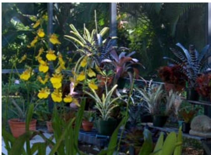
Daytime color. Colorful orchids growing next to patterned aechmeas such as Ae. chantini 'Shogun' and 'Samuri'.