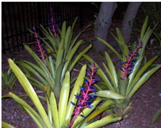
Night color. Aechmea 'Blue Tango' blooming in Jim Bixler's back yard.