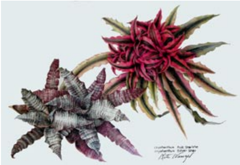
Cryptanthus 'Silver Star' and Cryptanthus 'Pink Starlite'

Neoregelia 'Magic Palette' is from the same Grex as Neoregelia Kiti Wenzel'