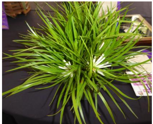
DIV XII Sec B- Commercial Navia lactea Michael’s Bromeliads