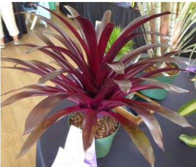
DIV XII Sec A- Commercial Vr. Voodoo Magic Michael’s Bromeliads