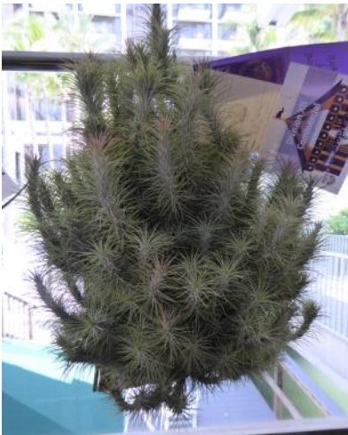
DIV XII Commercial Tillandsia funkiana Exhibitor: Tropiflora