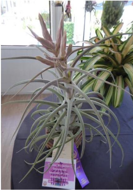
DIV XII Sec C- Commercial Tillandsia ehlersiana var. gigantesco Exhibitor: Tropiflora