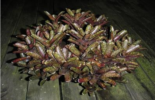
Top to Bottom, Left to Right. Cryptanthus 'High Voltage', Billbergia 'Incendiary Delight', Cryptanthus 'Judy B', Neoregelia 'Mo' Pepper Please', Neon Comfort , Orthophytum 'Mother Lode', Neoregelia 'Match Point'.