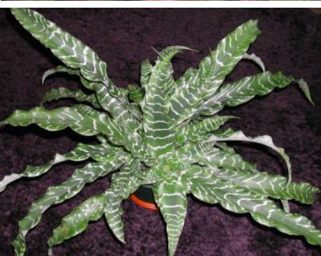
Top to Bottom, Left to Right. Billbergia 'Ivory Tower', Cryptanthus 'Dr. Larry', 'Strawberries Flambe', 'Betty Ann Prevatt', Bil. 'Sparkling Burgundy', Cryptanthus 'Cinnamon on Toast', Billbergia 'Fire Opal'.