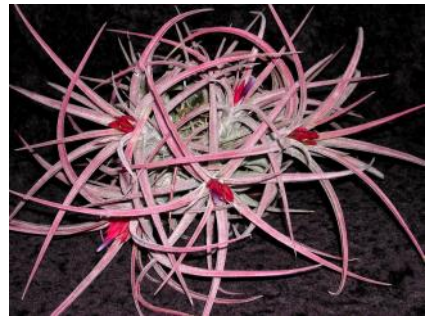
Top to Bottom, Left to Right. Pitcairnia 'Bud Curtis', Billbergia 'Peach Parfait', Neoregelia 'Pittsburg Style', Billbergia 'Prickly Heat', Cryptanthus 'Razor Back', Tillandsia ionantha 'Van Hyningii' x caput medusa .