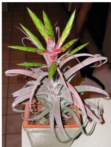
Left to Right. Cryptanthus 'Sweet Tooth', Billbergia 'Tuti Fruiti', Billbergia 'Cherry Bomb', Tillandsia streptophylla X concolor .