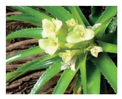
The other 4 species on the list moved from Cryptanthus to Haptocryptanthus , as far as I know, have not been imported into the United States.