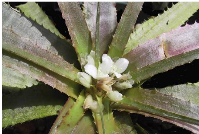
Cryptanthus leopoldo-horstii = Forzzaea leopoldo-horstii