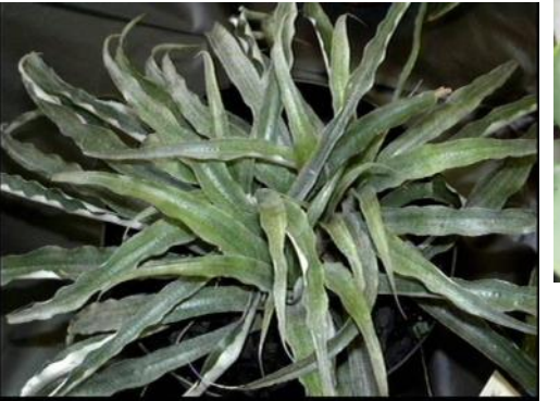
Cryptanthus scaposus = Rokautskyia scaposa