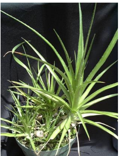
Haplocryptanthus vidaliorium may be available in the USA.