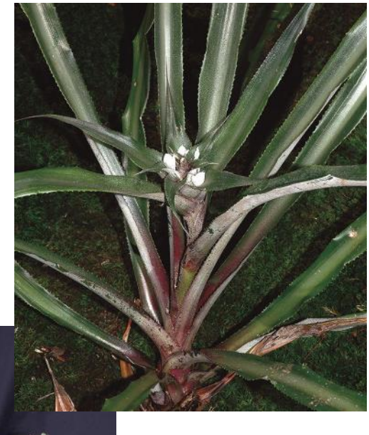
Cryptanthus odoratissimus = Rokautskyia odoratissima

Cryptanthus microglazioui= Rokautskyia microglazioui