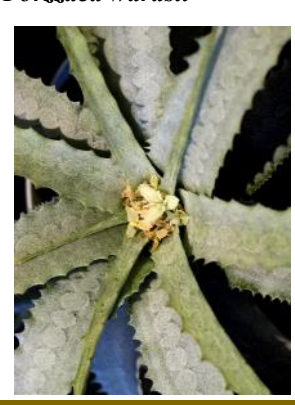
Cryptanthus warasii = Forzzaea warasii