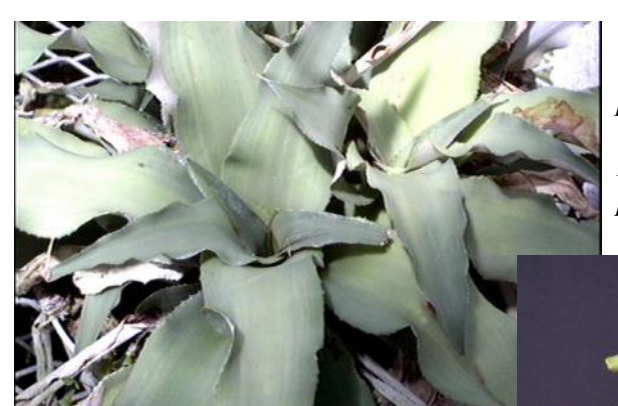
Cryptanthus pseudoscaposus =