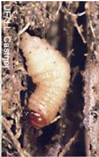
Metamasius call zone Larvae