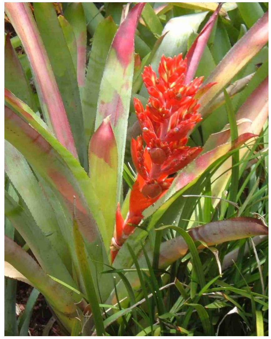
Aechmea 'Tropic Torch' -Aechmea beeriana (formerly Streptocalyx poeppigii) x Aechmea chantinii (SEE NOTICE INSIDE)