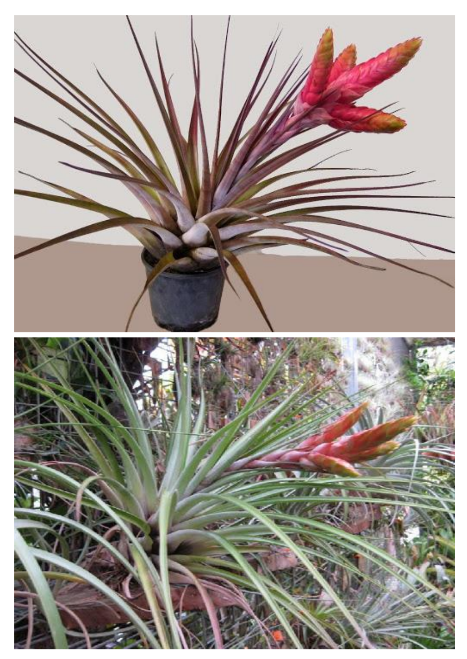
Top picture is that of Tillandsia 'Magnificent' and lower picture is of Tillandsia 'Tropiflora'. Both were considered cultivars of the species Tillandsia fasciculata . Now per Anthony Warfield, thoughts are that the cultivar of Tillandsia fasciculata called 'Tropiflora' may actually be a hybrid of T. compressa and T. fasciculata from Jamaica. And T. fasciculata 'Magnificent' from Central America may be a natural hybrid.