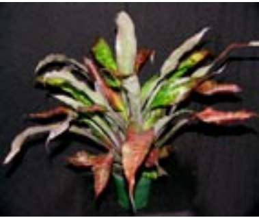
Best Multiple Cryptanthus Cryptanthus 'Calypso' Exhibitor - Steve Hoppin