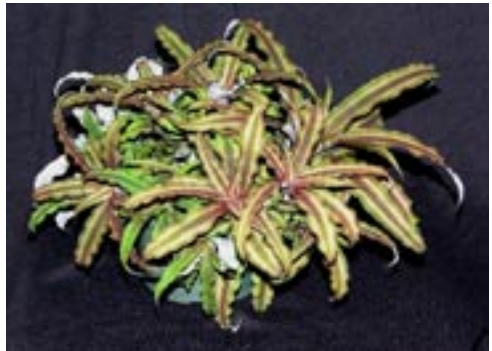
Cryptanthus Sweepstakes Represented by Cryptanthus bivittatus Exhibitor - Larry Giroux