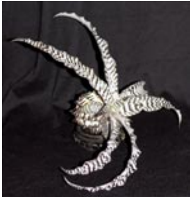
Division IV SecA Cryptanthus 'Absolute Zero' in Sea Shell Exhibitor - Larry Giroux