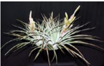
Best Blooming Tillandsia Tillandsia chiapensis x tricolor Exhibitor - Terrie Bert