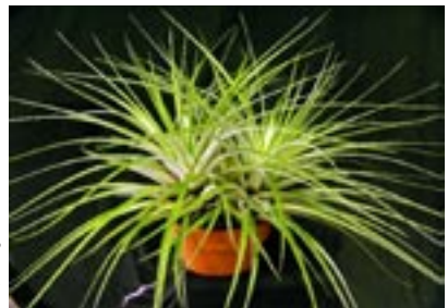
Best Non-blooming Tillandsia Tillandsia ‘Tropiflora’ Exhibitor - Betty Ann Prevatt