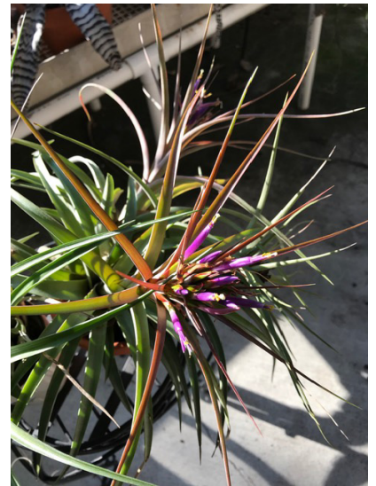
Tillandsia aff capitata