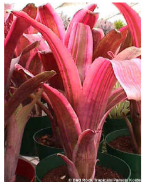
Billbergia 'Dorothy Berg' †