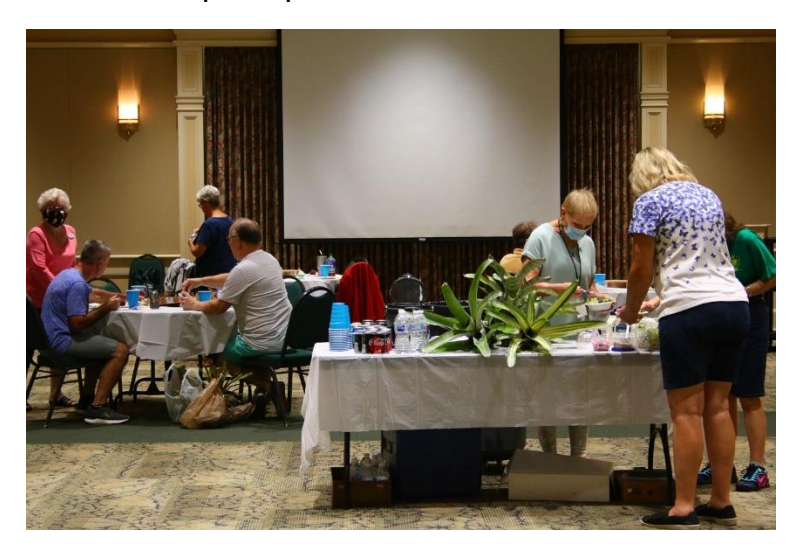
Show and tell