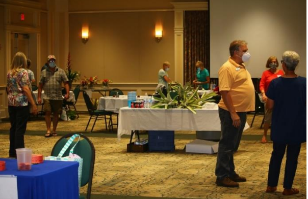
Lots of plants on the Door Prize table and also on the Raffle Ticket table.