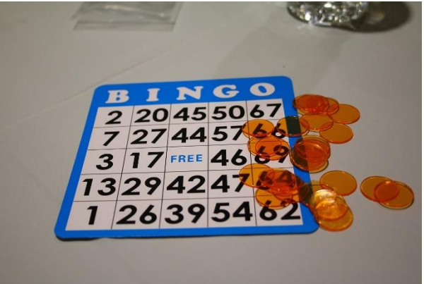
The BINGO prize plants are in the center of this table.