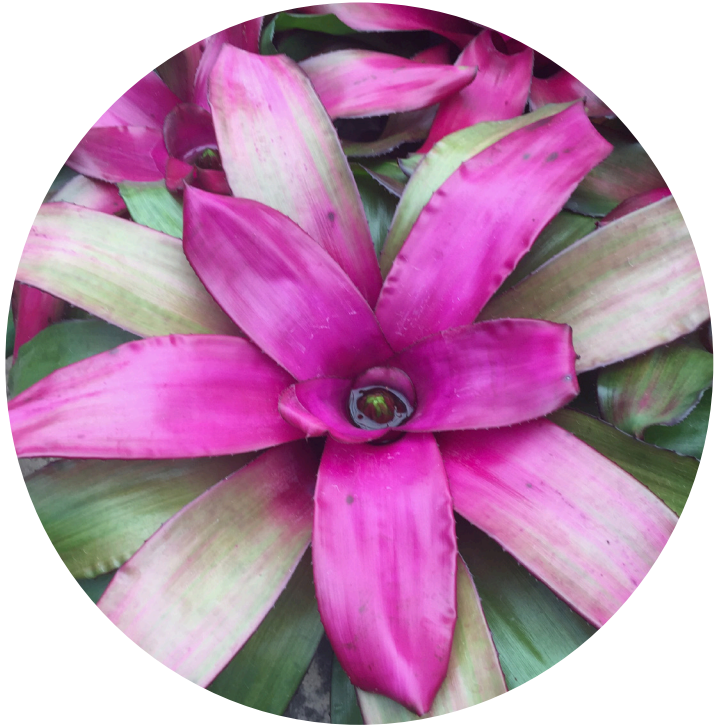
Top: Neoregelia 'Royal Flush' from McCrory's Bromeliads