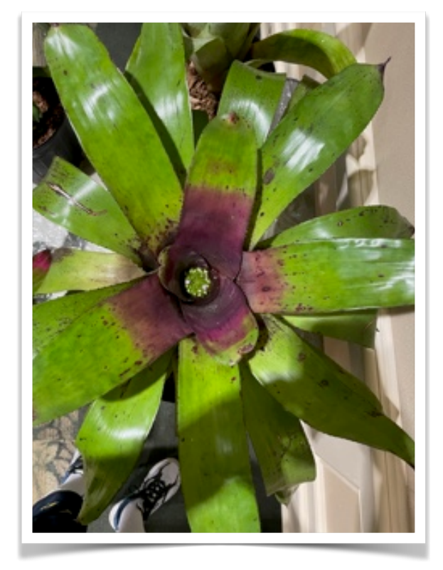
Neoregelia concentries 'Plutonis'