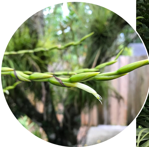
Here is an update on the growth of my Tillandsia utriculata inflorescence, first shown in the February Orlandiana.