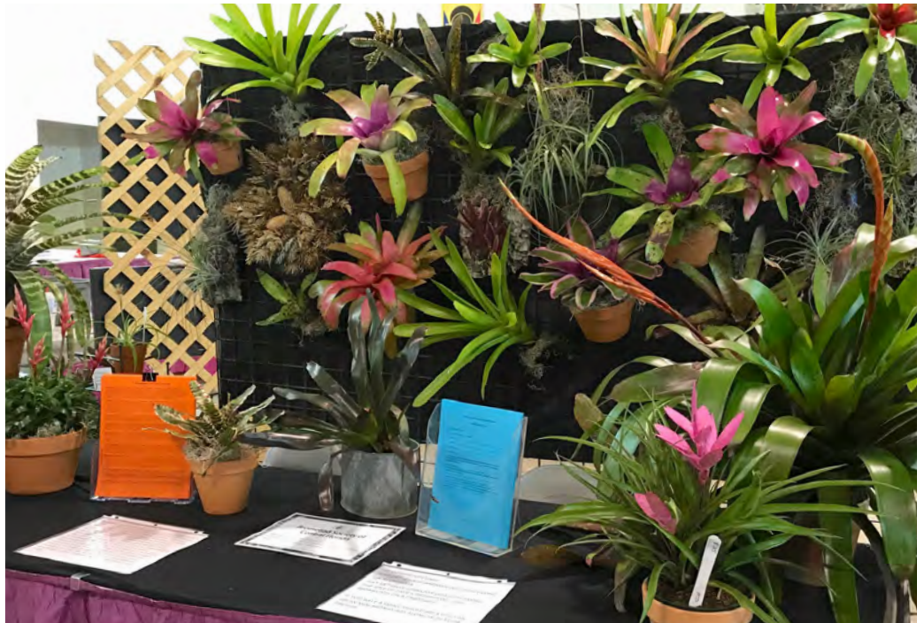
A display of miniatures on one end of the area had a very popular little ornamental pineapple. We could have sold a bunch of them...start growing them for future plant sales! Large impressive Vrieseas flanked the display table.