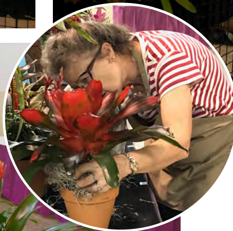
Thanks for all the hard work everyone, both tables looked vibrant and wonderful!