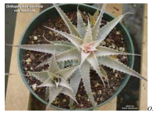
saxicola var saxicola

O. vagans. Padilla described this as a "trailing plant, [whose] elongated stem rambles over and around rocks, forming large mats." The flower bract is formed at the top of the leaves and sits down inside, never rising to any height. The color of the leaves ranges from green to orange and red at maturity.