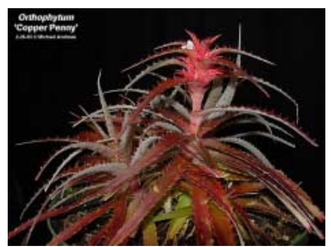
O. 'Copper Penny'

An Orthophytum is a good bromeliad to grow in our area. Their diverse shapes and inflorescences make them an interesting addition to any bromeliad collection.