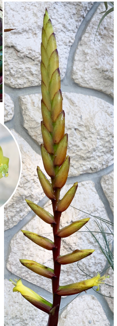
Vriesea warmingii x Vriesea fosteriana (right)