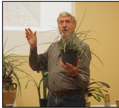
Puya laxa