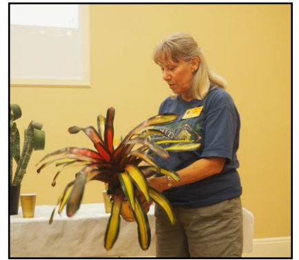
Neoregelia 'Margaret'