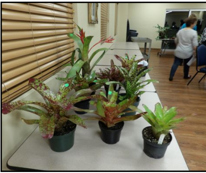
Plant Sale Table