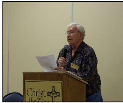
Call to Order