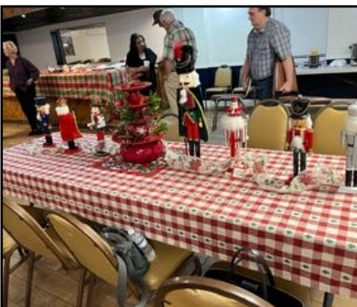
Table Decorated by Verna Dickey