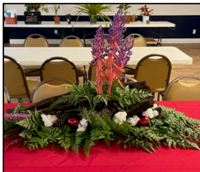
Table Decorated by Tom Wolfe