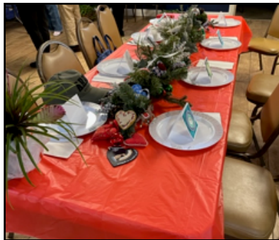
Table Decorated by Jill Zakaroff