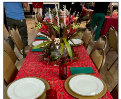
Table Decorated by Cheryl Victor