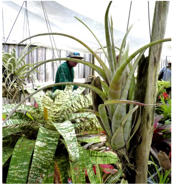
Tillandsia flexuosa mounted on driftwood next to Vriesea ospinae gruberi cultivar