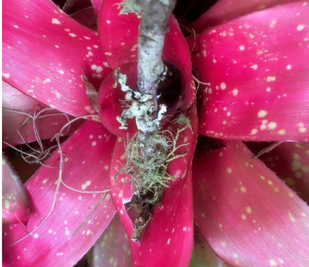
Neoregelia Treasure Chest – note the stick near the center cup.

lawn dart in the middle of leaf on my plant, neatly splitting the bromeliad leaf in two.