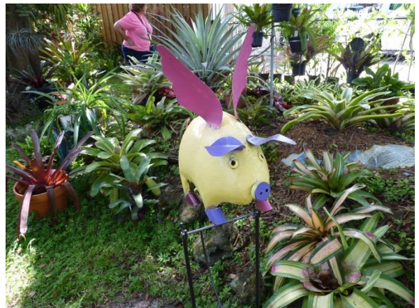
Pigs fly in Lisa's front yard!