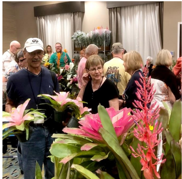
Their hands are full, but surely they must need just one more?