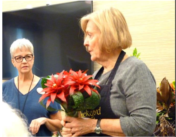
The "Backyard florist" demonstrates using bromeliads in floral arrangements