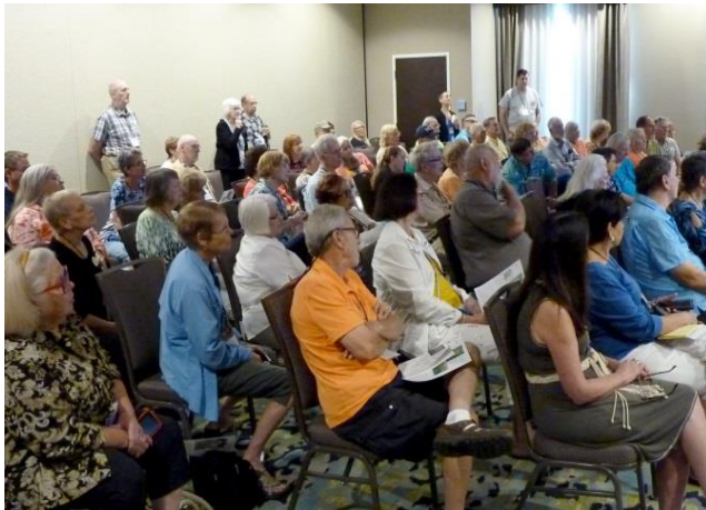
The seminars were "standing room only", but we heard no complaints since the subject matter was fascinating!