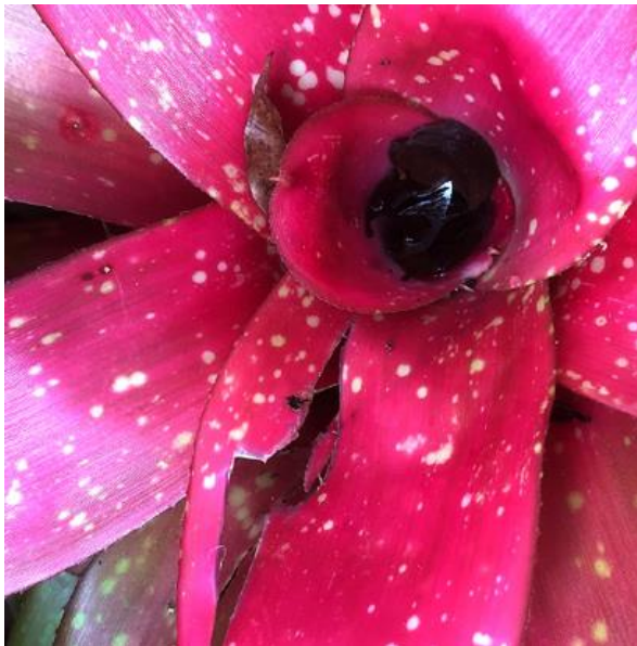
Falling stick neatly split a leaf on this Neoregelia.