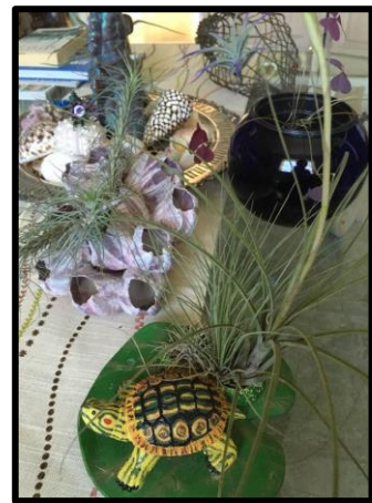
Charlotte Mueller's decor