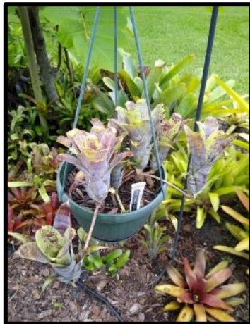
Neoregelia pauciflora