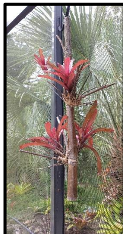
Iris Graim's mounted bromeliads