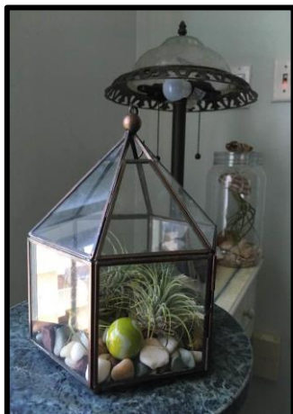
Charlotte Mueller's terrarium