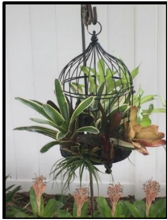
Sherrie Thompson's creations with thrift store items.