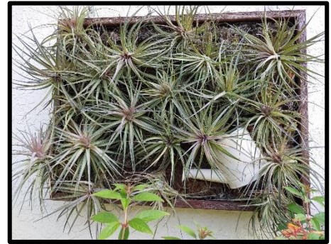
Jane Villa-Lobos' wall frame.