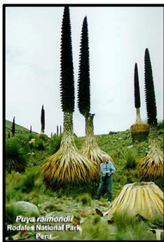
Puya raimondii in Rodales Nat. Park, Peru

Puya: This genus is found in the high elevations of the Andes Mountains throughout South America making them very hardy. They like plenty of sun and water during the summer growing season and dry during winter surviving temperatures in the teens. They are terrestrial with stiff leaves and sharp spines and are slow growing. The largest species is Puya raimondii found in Peru and Bolivia which can grow up to 30 feet tall and 9 feet across (See videos to watch).