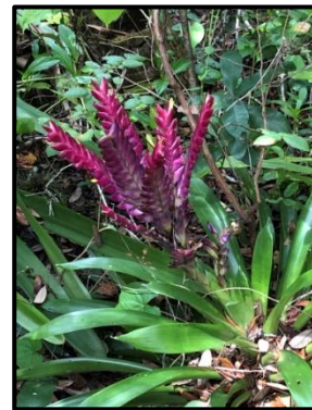
Vriesea (Calandra Thurrott)