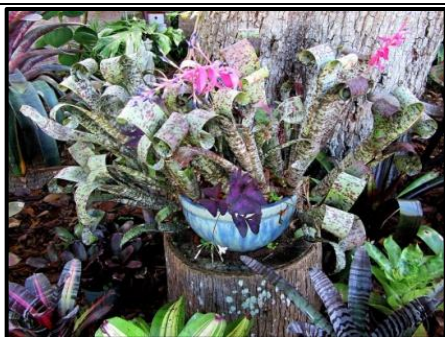
Quesnelia marmorata 'Tim Plowman'