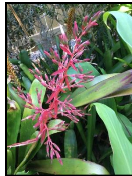
Porteas from Bill Hazard's gardens

Portea: If you want a large plant with a spectacular inflorescence, then you should get a Portea . This is a small genus with only eight species and a few hybrids. The most common species is Portea petropolitana which is very spiny with a colorful bloom spike (pink, rose, purple, blue, teal) in late spring. In early summer colorful purple fruits appear. It can be grown in shade or sun and can get to 42" tall with the flower spike. It is a great landscape plant.