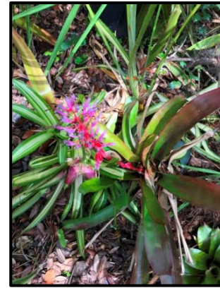
Portea 'Candy' (Calandra Thurrott)