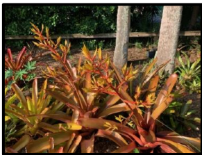
Aechmea blanchettiana (Rosie Byard)

We love to see pictures of bromeliads in our members' gardens.