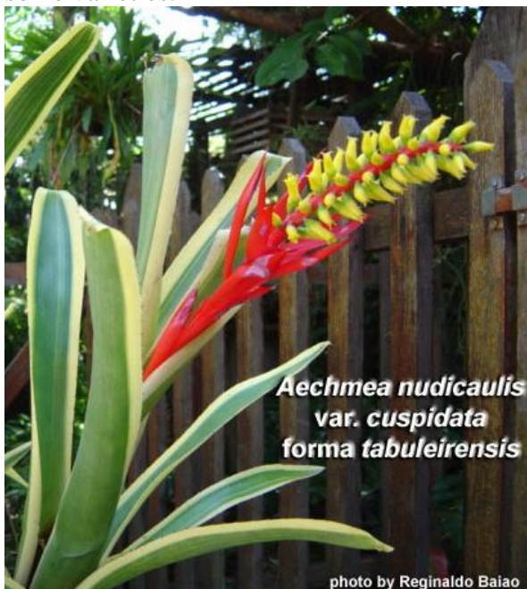
Aechmea nudicaulis var. cuspidata forma tabuleirensis

The inflorescences or blooms of most varieties of nudicaulis are similar in that they usually have striking, bright red scape bracts (those are the ones on the stalk of the blooms spike, below the flowers) and bright yellow flowers arranged in a cylindrical form – although even that trait may be different in some varieties.