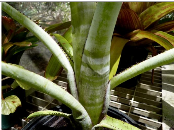
'Thumbprint' at base of leaf is good indication that this is a form of Aechmea nudicaulis .

The inflorescences or blooms of most varieties of nudicaulis are similar in that they usually have striking, bright red scape bracts (those are the ones on the stalk of the blooms spike, below the flowers) and bright yellow flowers arranged in a cylindrical form – although even that trait may be different in some varieties.