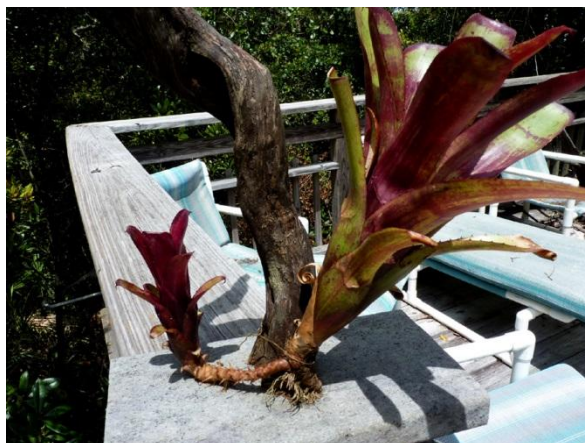
Aechmea nudicaulis var. rubra – was originally obtained as a plain green plant, but soon developed a deep red color when grown in full sun.