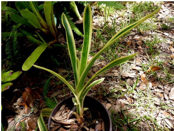
Albomarginated form of Aechmea nudicaulis .

nudicaulis are out there on sales tables and in bromeliad growers' collections? How many licks does it take to get to the center of Tootsie Roll pop? The world may never know! This is likely due to the fact that nobody has had the time to thoroughly examine and formally describe each of what appear to be distinctive differences among this group of plants - all of which are called Aechmea nudicaulis .