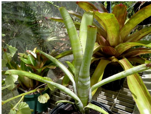
Unknown variety of Aechmea nudicaulis , tentatively identified as "Good Bands"

Finally, since we are approaching the end of our Summer growing season in east central Florida, I should mention that I have found most varieties of Aechmea nudicaulis to be reasonably cold hardy – meaning that I don't look to protect plants in my collection from the cold unless temperatures are predicted to dip below freezing. Anything colder than that and you are liable to either lose some plants or they will show signs of cold damage. If you haven't already done so, consider adding Aechmea nudicaulis to your collections, and, by the way, the Aechmea nudicaulis that I obtained from the Seminole society appears to be nearly identical to the photo of Aechmea nudicaulis "Good Bands" on the Florida Council website – mystery solved.