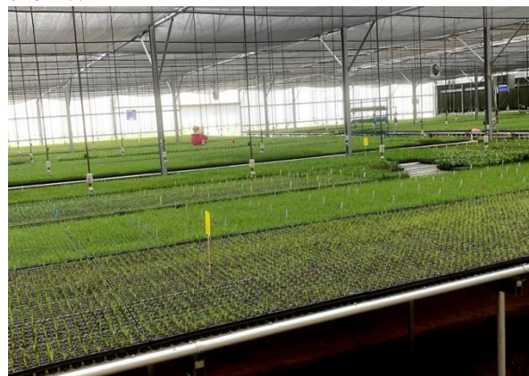
These are all seedling bromeliads!

Recently we had the opportunity to visit the wonderful folks of Phoenix Foliage in Winter Garden and what a treat that was! I took a photo to give you an idea of what over 600,000 bromeliads looks like. That's right – over 600,000 bromeliads in their greenhouses, but that's not all they grow there. Many different types of tropical foliage plants...lots and lots and lots of them!!