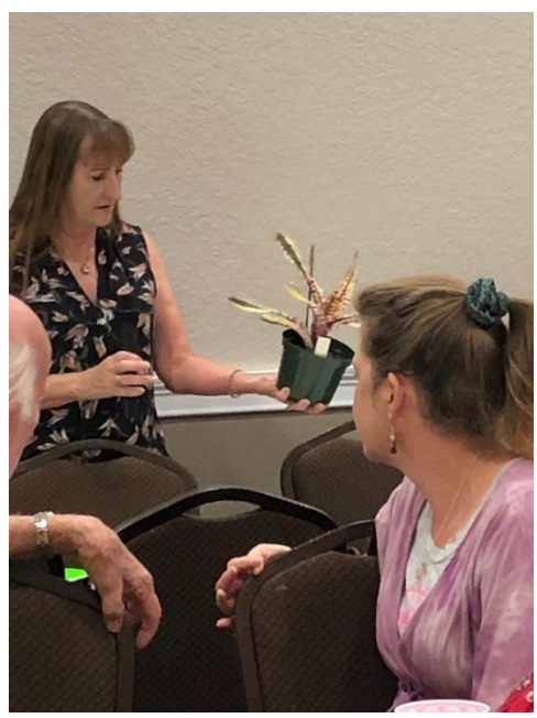
Another outstanding example of a hybrid Neoregelia by Chester Skotak