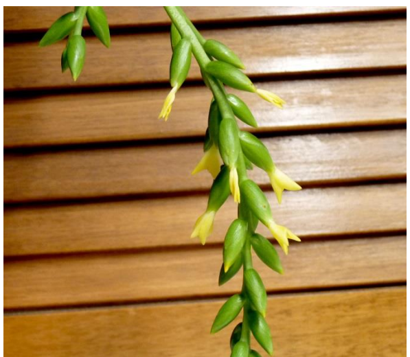
Small yellow flowers in inflorescence with several short branches.

If you purchased any of these plants at our club meeting, please be advised that the correct name should have been given as Catopsis nutans and not "Catatopsis", although, I kind of like the sound of "Catatopsis", ...especially if it is mounted on a hot tin roof!