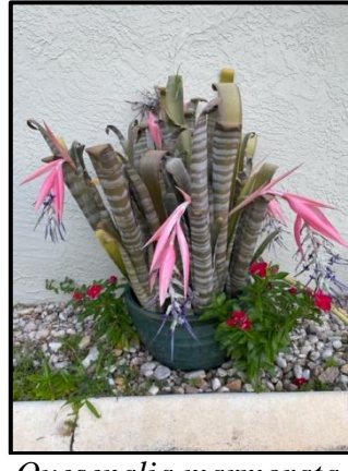
Quesenalia marmorata 'Tim Plowman'