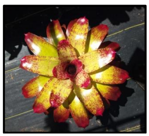
Neoregelia 'Fruity Pebbles'