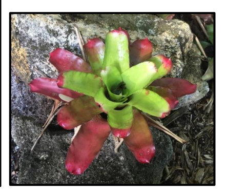
Neoregelia 'Victoria's Secret'