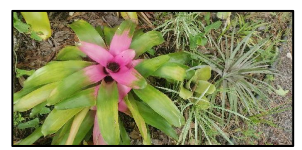
Neoregelia and Dyckias