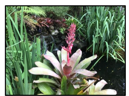
Aechmea 'Pink Flamingo'