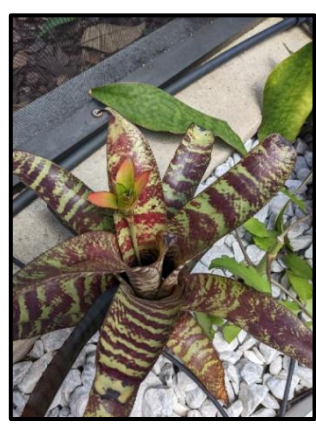
Canistrum seidelianum