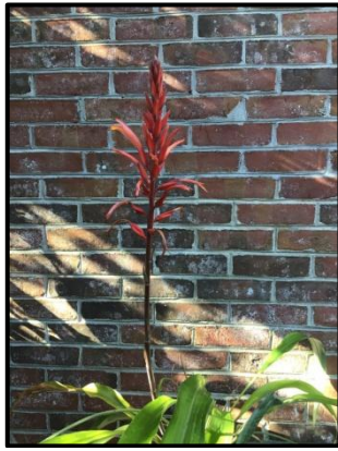
Pitcairnia ungulata