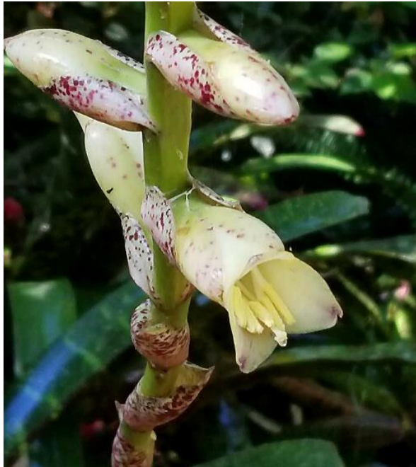
Close-up of open flower on the inflorescence.

The name tag says “Vriesea Chocolate”, but there doesn’t seem to be any hybrid registered under that name. Not to worry though, it’s still a beautiful plant and certainly looks like a form of Vriesea fosteriana – a wonderful plant that comes in many light and dark forms... or perhaps a hybrid with fosteriana in its parentage. Thanks Cricket!