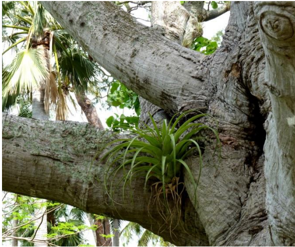
Tillandsia utriculata on tree in front of the Edison house.

And by the way, either when you are heading to Edison House in Ft. Myers or on the return trip home - if you happen to pass through LaBelle around lunch or dinner time, be sure to stop in at the Log Cabin restaurant in the downtown area. You won't be sorry. Great food at a reasonable price in an interesting décor!