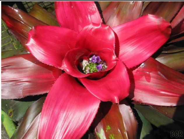
Neoregelia John Boardman