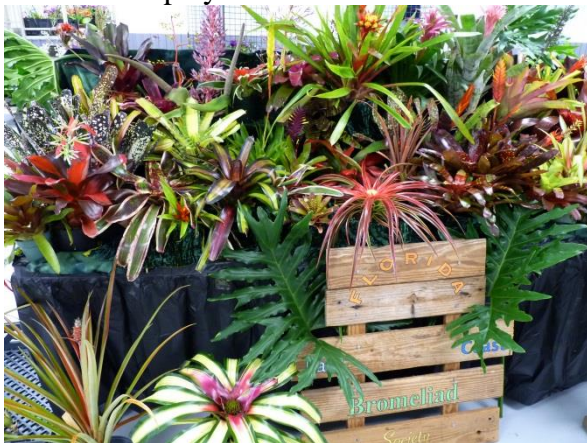
The finished product and award winner!

And, before you know it, you have created a beautiful display: