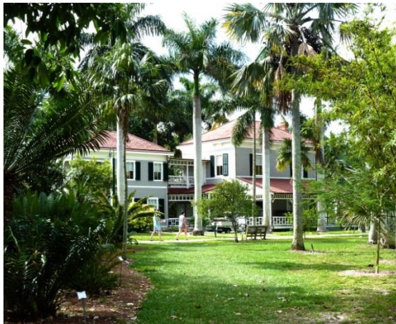
The Guest House at the Edison Estates.