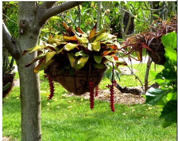
Hanging basket holding Aechmea warasii in bloom

You can spend a good deal of time just browsing through the hundreds of tropical shrubs, trees and even bromeliads for sale in the nursery... and that’s all in addition to the tours of the estate, the museum, museum store, etc. If you decide to visit this really nice attraction in Ft. Myers, you had better bring some walking shoes because it takes some time to see everything and the grounds are quite extensive!