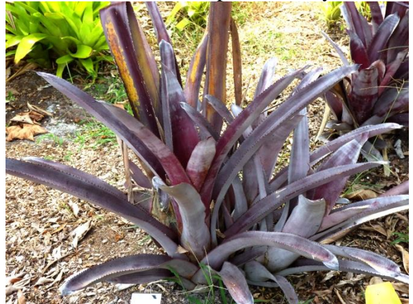
Aechmea Malva landscape planting.

Actually the correct name is “The Edison and Ford Winter Estates” and if you’ve never been there, this is definitely something worth traveling to see! For one thing, there are more than 20 acres of botanical gardens surrounding the restored winter homes of Edison and Ford (the car guy, not the president(s)) as well as a “garden shop” that is a full sized commercial plant nursery.